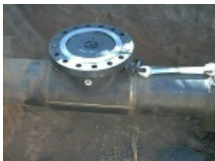
LineStop with completion plug