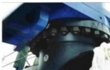
36" 600# Blackhawk LineStop Fitting