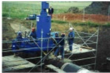
36" LineStop Fitting with 2400 Plugging Machine