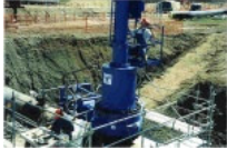
36" 600# LineStop Fitting with 2400 Tapping Machine