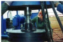
Installing 36" 600# Completion plug