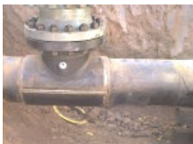
LineStop Fitting with 360# / 600#

Savcor Products service the Oil, Gas, Utility and Pipeline Industries.